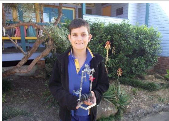
Year 4/5/6 Bridge Building Exercise