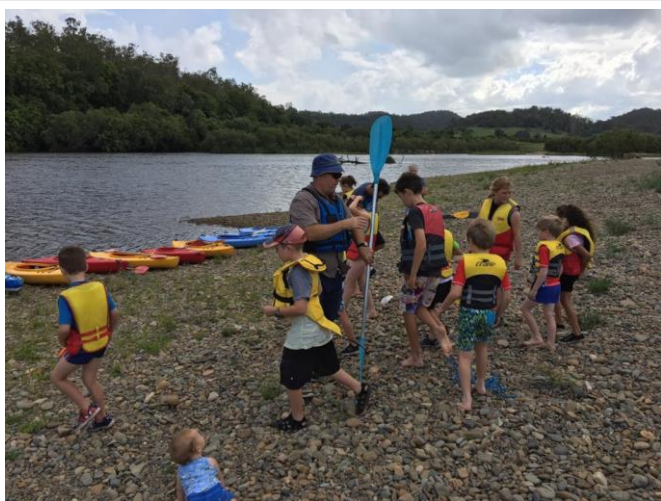
Having fun on the river yesterday afternoon