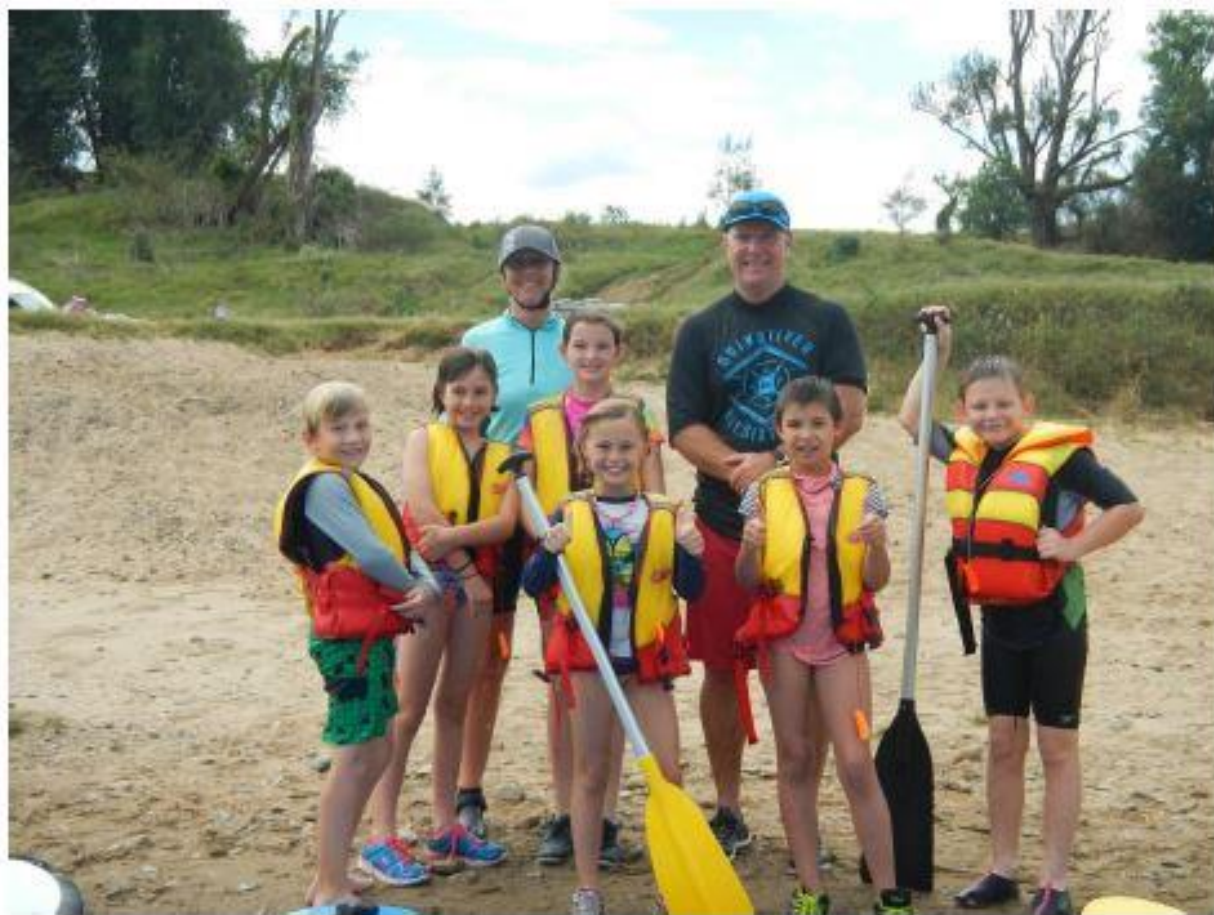
Students enjoy their Paddle Board experience